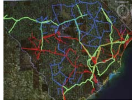
The data visualization above reflects data automatically built from GIS data and shows real-time updates from the SCADA system in KML files overlaying Google Earth.

As anyone who has upgraded home video equipment will understand, it takes more than a great hardware infrastructure to deliver spectacular results. A large format, high definition television is a good start, but it needs to be fed with high quality content to provide the desired image. The same is true with a control room. The investment in a video display wall cannot be justified if the same content available on the desktop is merely scaled up to fill a larger display surface. Given that, many organizations elect to build an overview display specifically for the display wall. This can be a good approach, but the customer needs to determine if the control